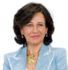
Ana Botín Group Executive Chairman